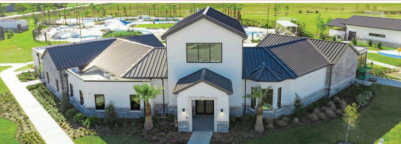
Amenity Village Clubhouse with Fitness Room