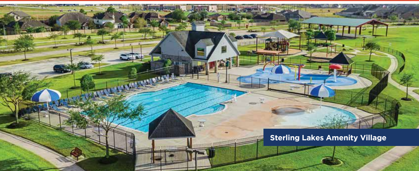
Sterling Lakes Amenity Village